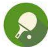
Table Tennis & Pool