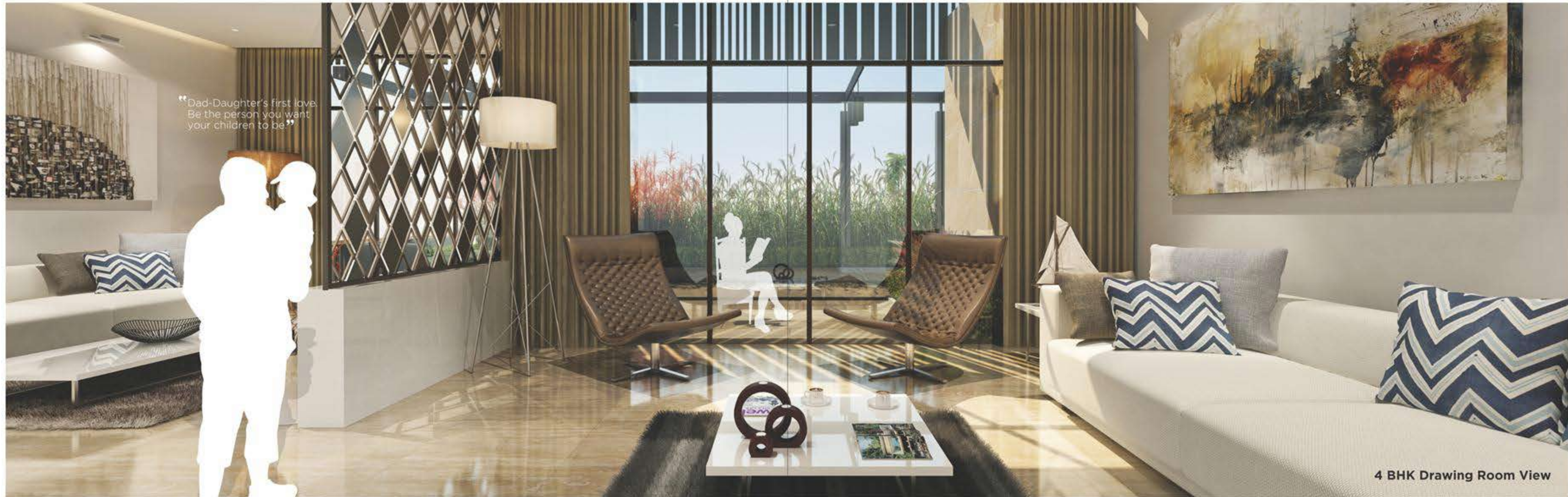
4 BHK Drawing Room View

“Dad-Daughter's first love. Be the person you want your children to be.”