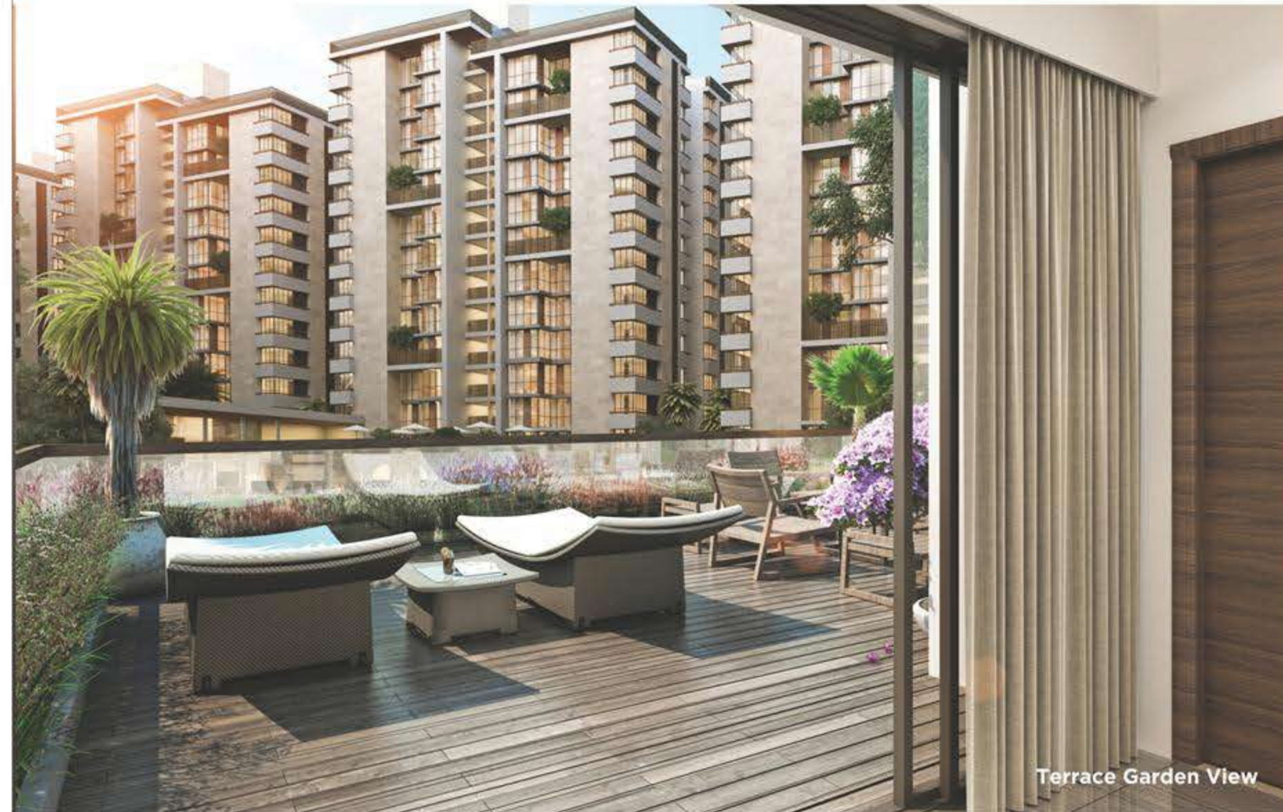
Terrace Garden View