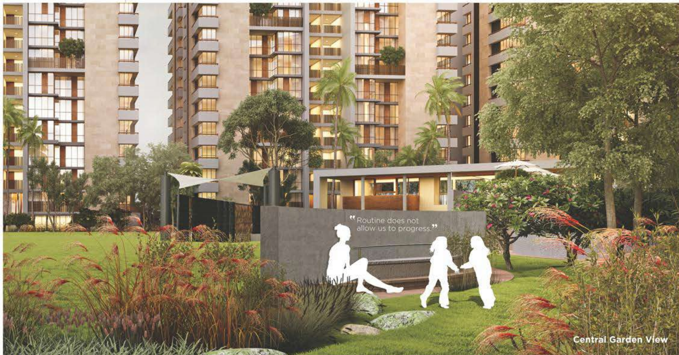
Central Garden View

Nature lives through us and we live through nature. It is only natural to find solace in nature, so why not live within natural surroundings. Find homes with best designing and engineering with nature's matchless beauty. MapleTree brings you a life where you wake up to your private garden each day and end your day with it.