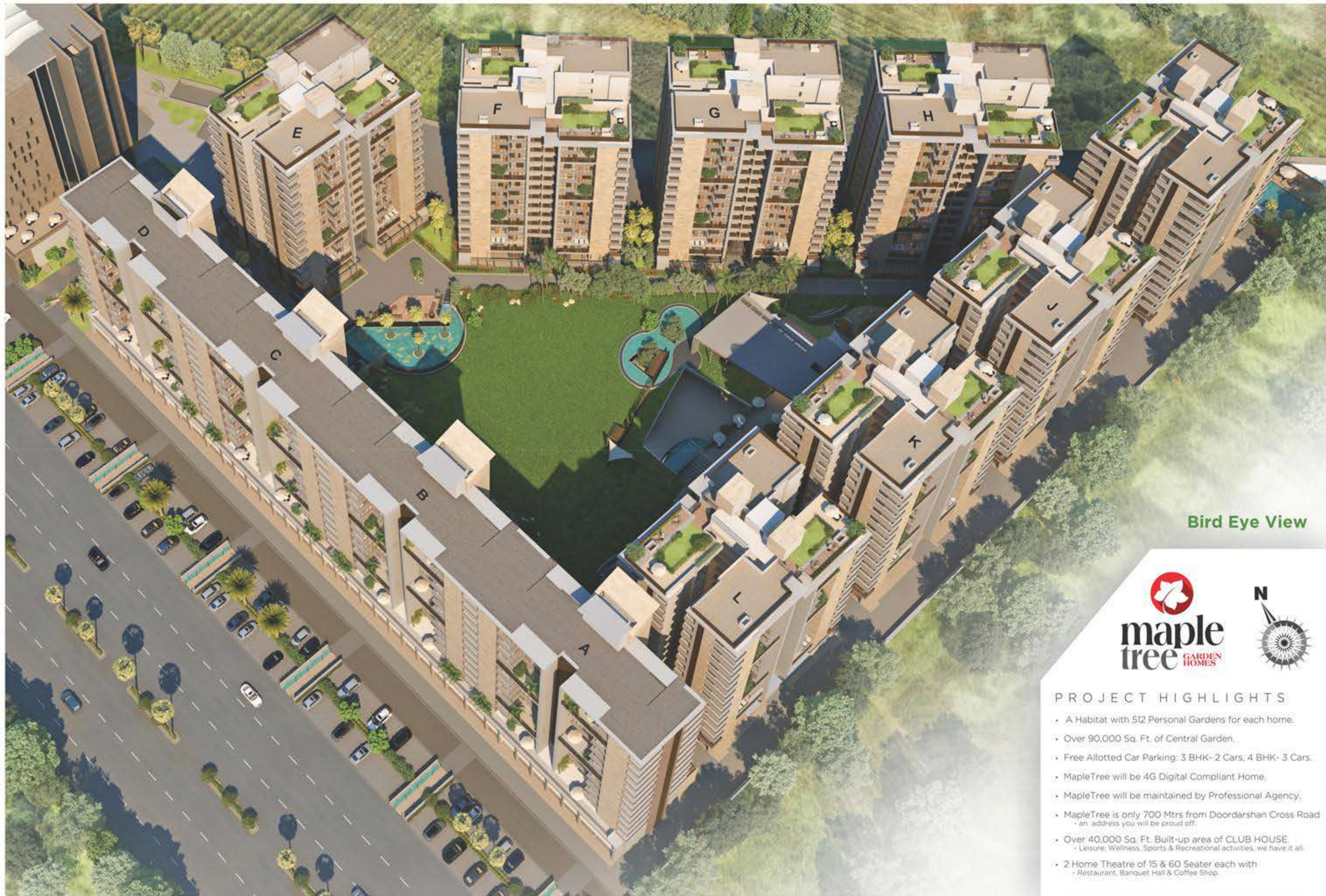
Bird Eye View