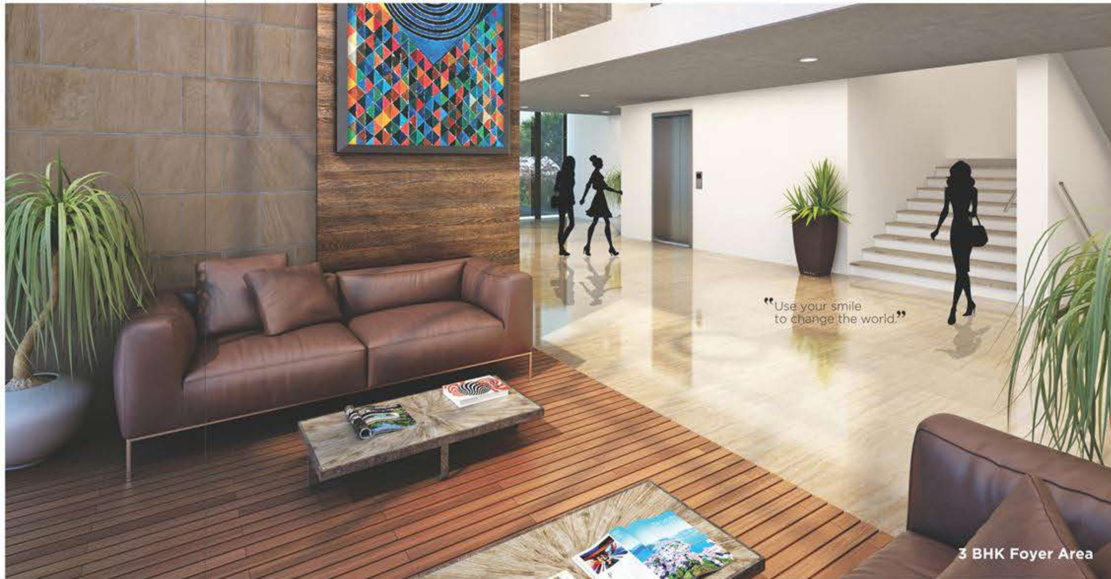
3 BHK Foyer Area