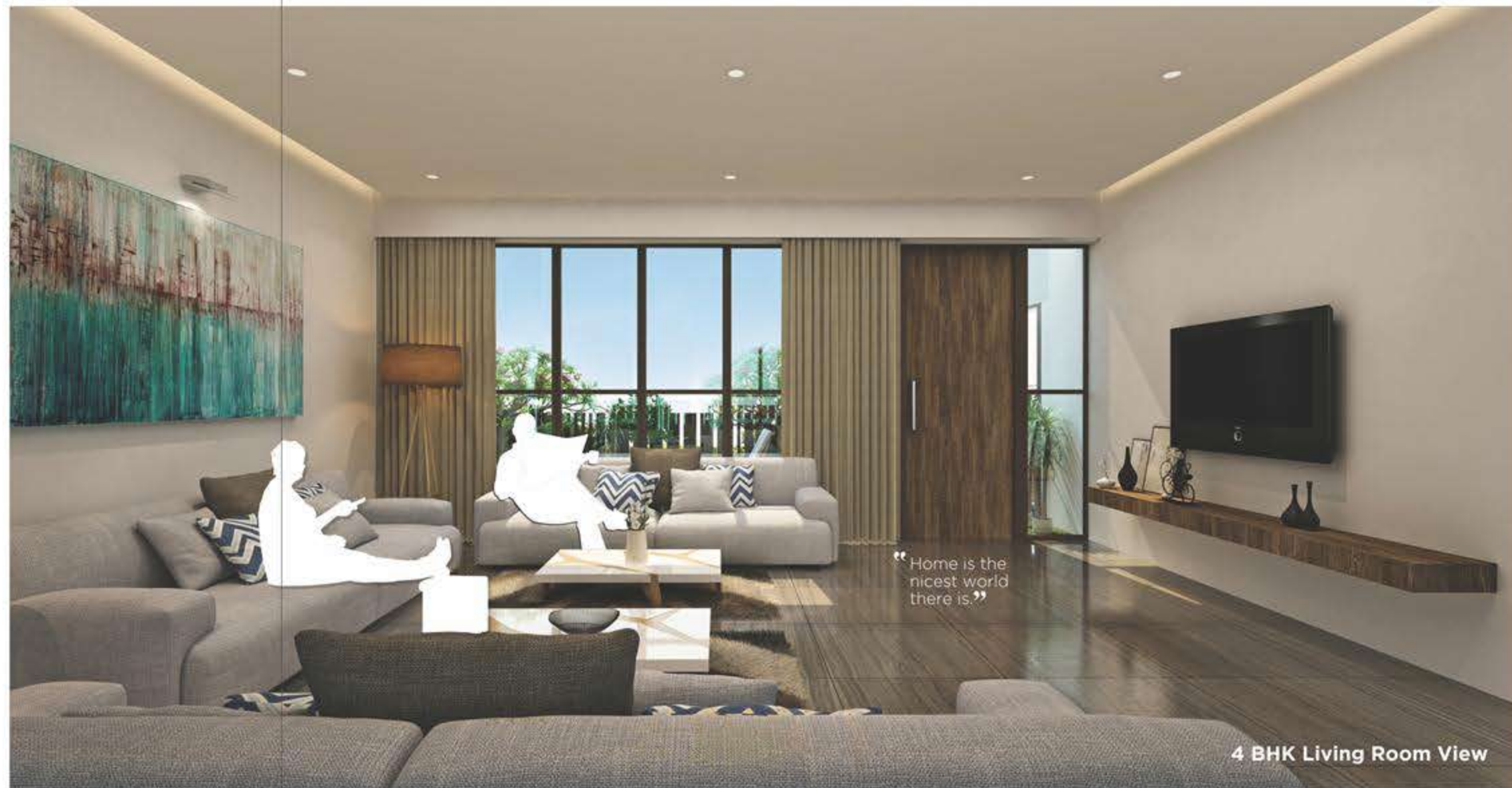
4 BHK Living Room View